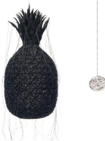
Tonico Lemos Auad (B. 1968) Black Pineapple/Lime, 2013 linen, thread and silver Estimate: £12,000-18,000