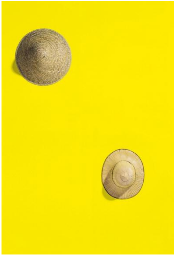
Alexandre Da Cunha (B. 1969) Nude XVII, 2013 hats and gold thread on linen 182.7 x 127.2cm Estimate: £12,000-18,000