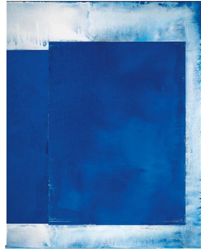
Hurvin Anderson (B. 1965) Attic, 2013 acrylic on linen, 187 x 147cm Estimate: £40,000-60,000

London - Leading UK and international artists have generously donated major works of art to a charity auction for Gasworks, a UK registered charity providing studios and programmes for some of the most promising artists in London. The vital funds raised will contribute to the purchase and renovation of the gallery, the education space and artists' studios, in Gasworks' home of 20 years. Christie's is pleased to collaborate with Gasworks in developing this selection, which will be offered for auction on Saturday 19 October 2013 at 1pm as part of the Post War and Contemporary Art day auction.